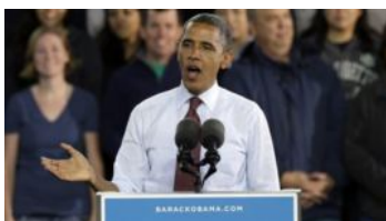
President Barack Obama speaks during a campaign stop in Milwaukee, Wisconsin, September 22, 2012.