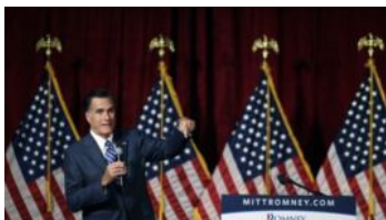
Republican presidential candidate and former Massachusetts Governor Mitt Romney speaks at a campaign fundraising event in Del Mar, California, September 22, 2012.

US Political Parties Battle Over ID Laws