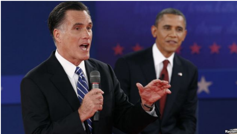
Republican presidential nominee Mitt Romney, left, and President Barack Obama during second U.S. presidential campaign debate, Hempstead, New York, October 16, 2012.